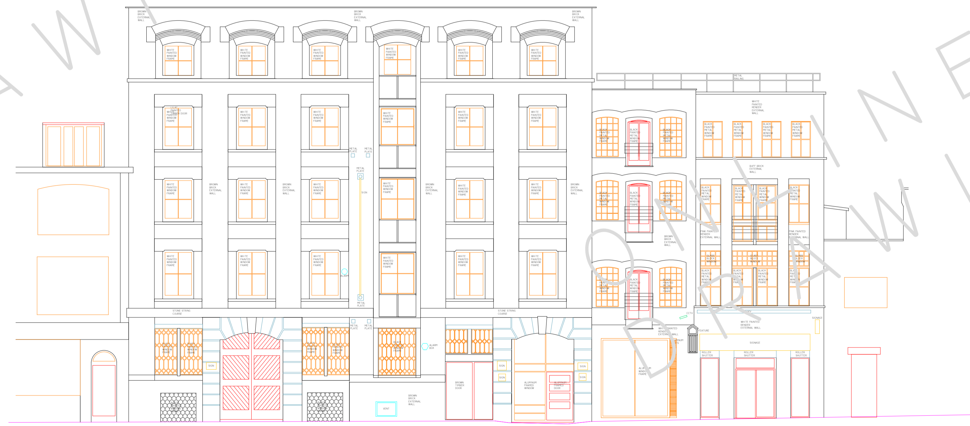
SOUTH ELEVATION 1:100 SCALE