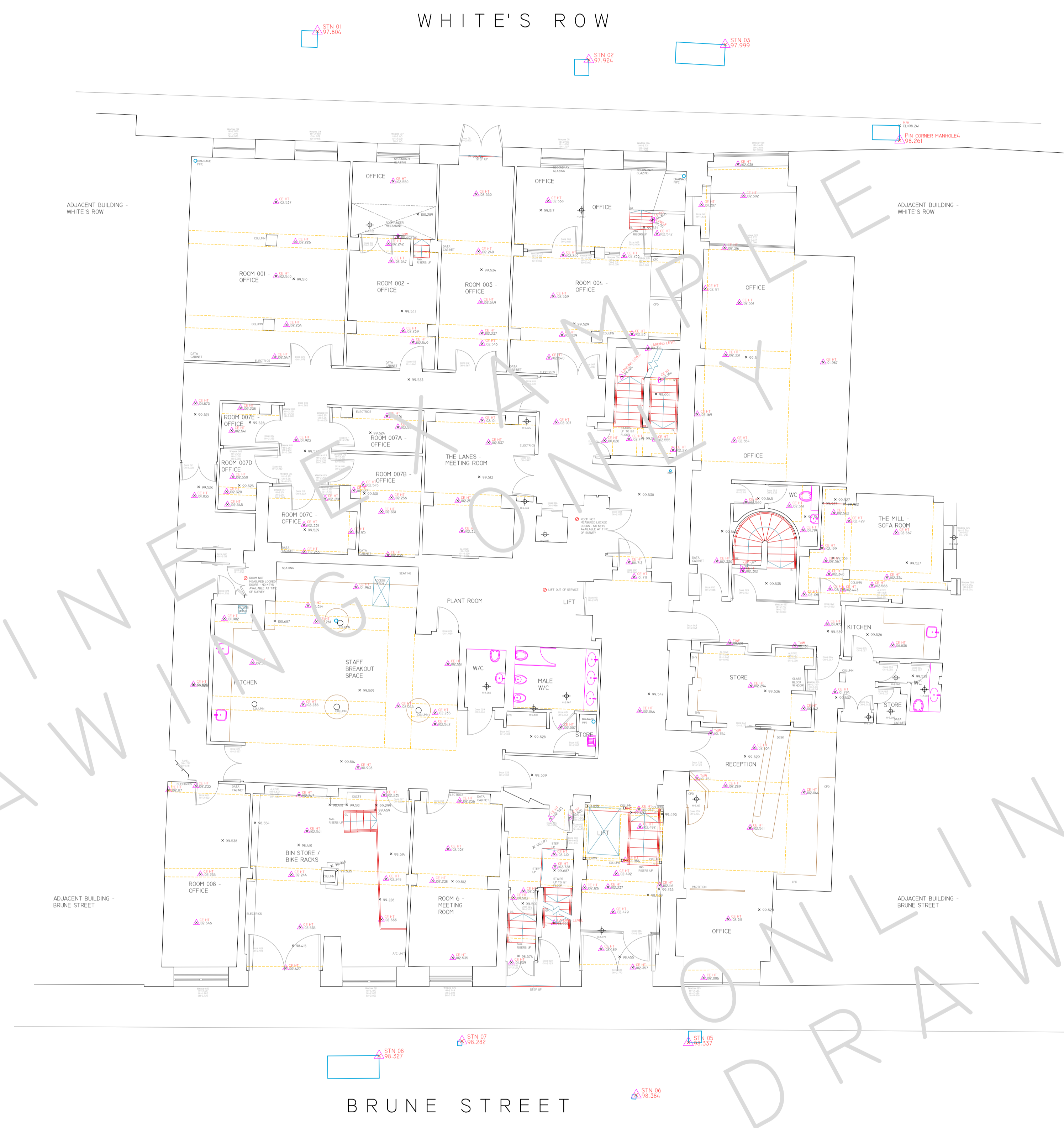
GROUND FLOOR PLAN 1:100 SCALE