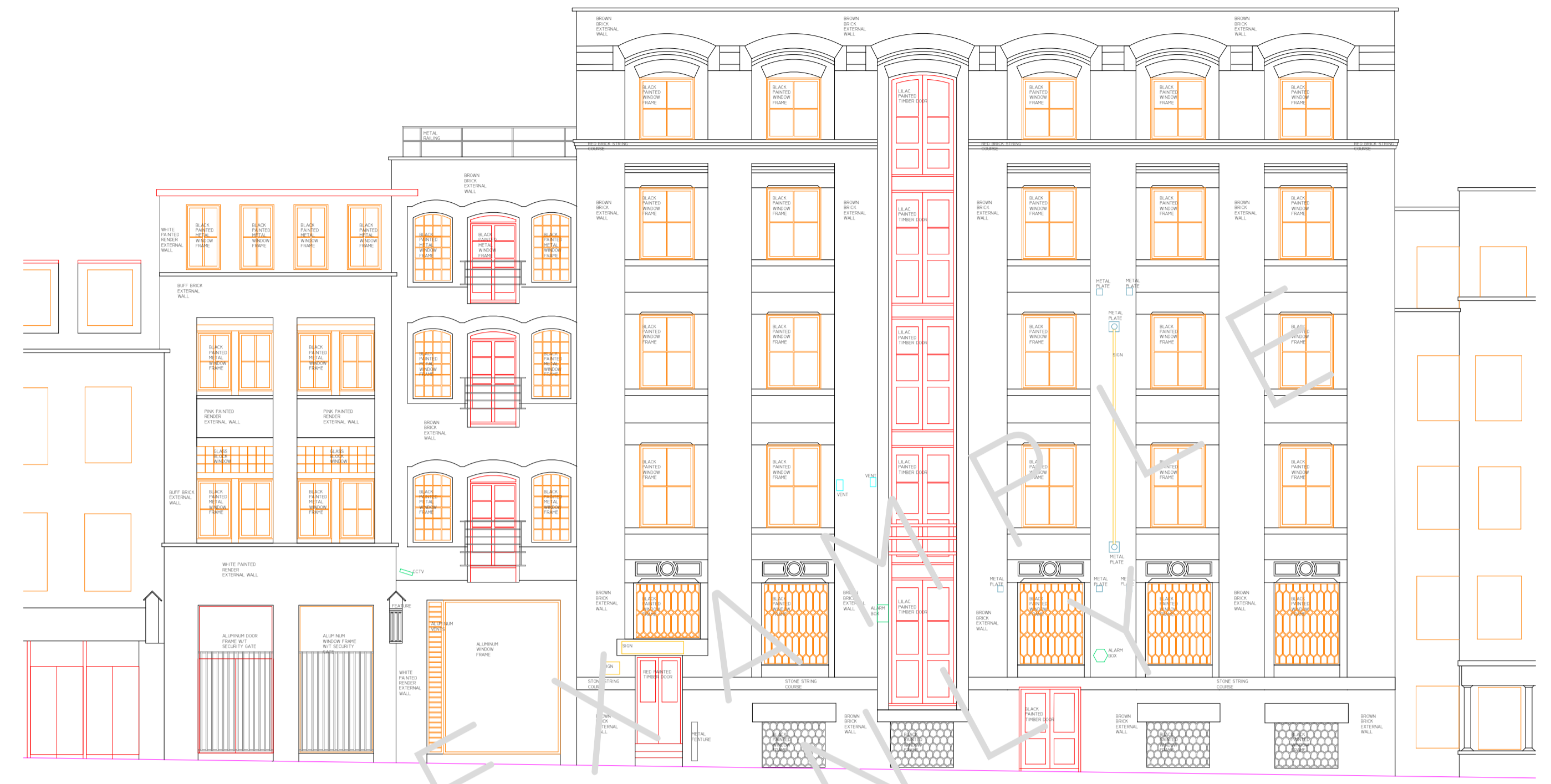
NORTH ELEVATION 1:100 SCALE

NOTE: AREAS DRAWN INDICATIVELY NOTED AND INDICATED BY GREY DASHED LINE AS LINE BELOW -----